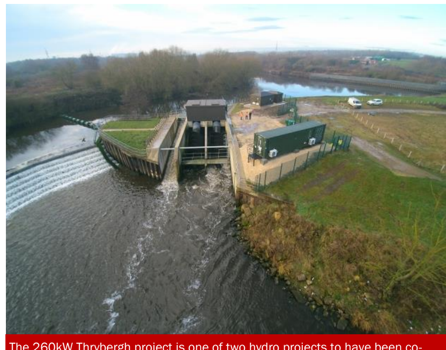
The 260kW Thrybergh project is one of two hydro projects to have been colocated with a 1.2MW/1.2MWh battery.

Battery energy storage is now being used at two of the largest river hydro projects to deliver a range of grid services, load shifting and energy trading, with a third planned for later this year by Barn Energy.