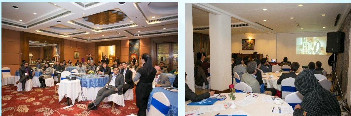
International Training Programs by World Renowned Organisations

On the final day of the event, trainings on much needed topics were provided by the world renowned organizations. Altogether, there were 4 training programs. One training was held on 28 th January which was on Hydropower Economics, Financing and Risk and rest 3 were on the final day (29 th January). Trainings on Micro-grids; Engineering, Procurement, Construction and Financing (EPCF) and Sustainable Energy Development and The Role of Hydropower were held.