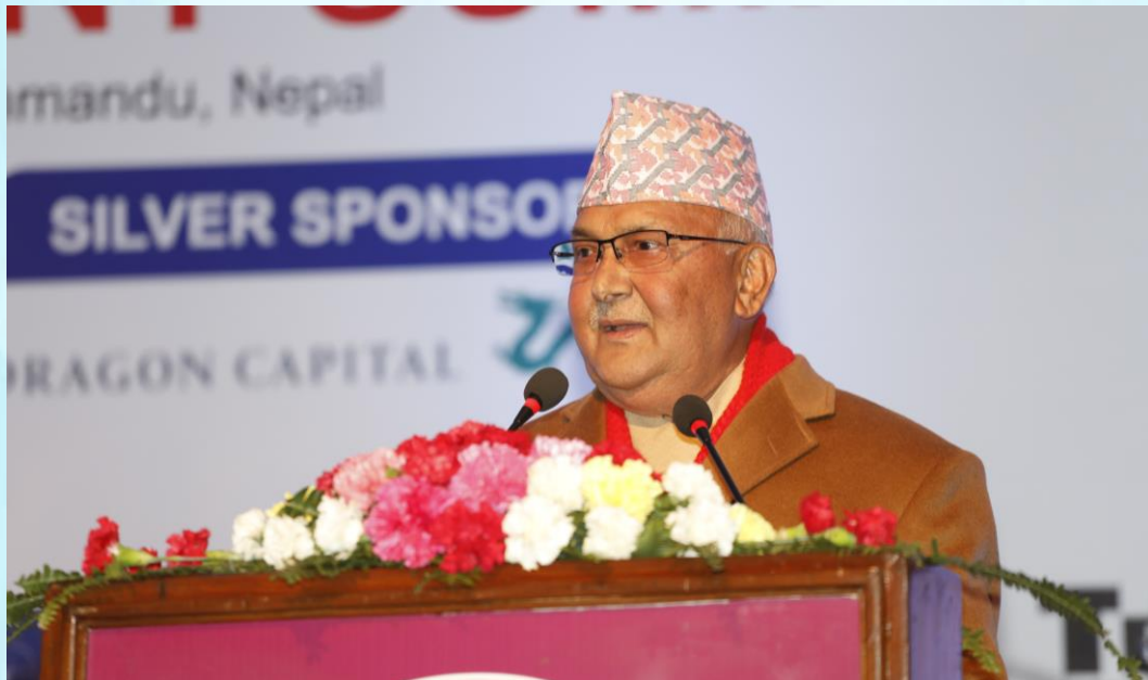
Rt. Honorable Prime Minister of Nepal, Mr. KP Sharma Oli with the closing remarks in NPIS 2018

Distinguished guests, delegates participating in the summit, ladies and gentlemen.