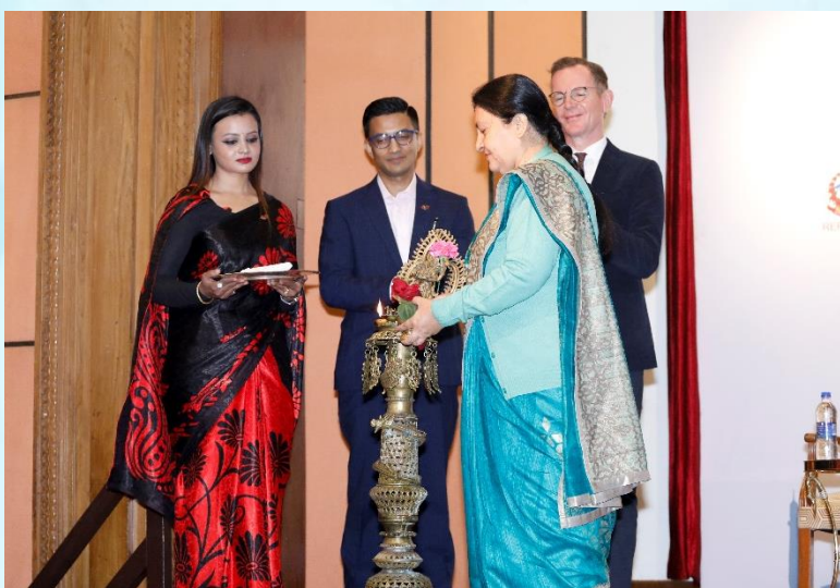
Rt. Honorable President, Ms. Bidhya Devi Bhandari inaugurating the summit by lighting panas