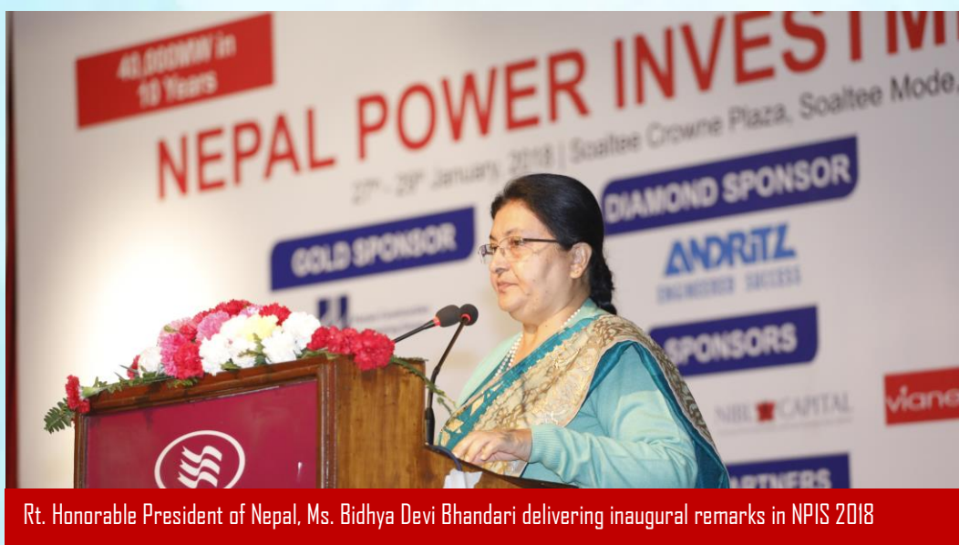
Rt. Honorable President of Nepal, Ms. Bidhya Devi Bhandari delivering inaugural remarks in NPIS 2018