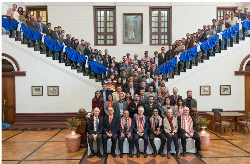
A group photo with the chief guest, resource persons, participants and organizers